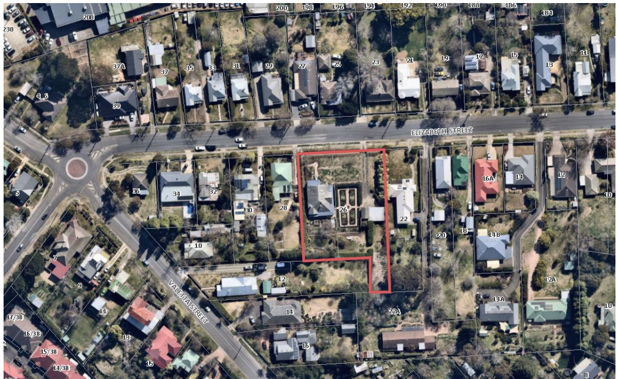
Figure 2: 'Karingal' (outlined) in the context of Elizabeth Street (Nearmap).