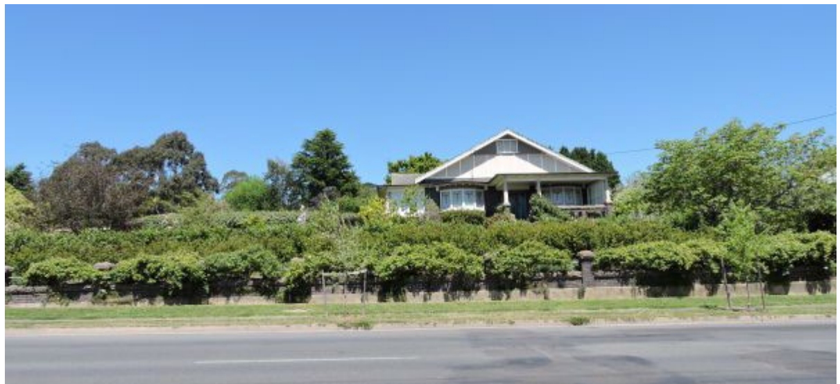
Figure 3: Photo of 'Karingal' from the street showing the brick and trachyte fence.