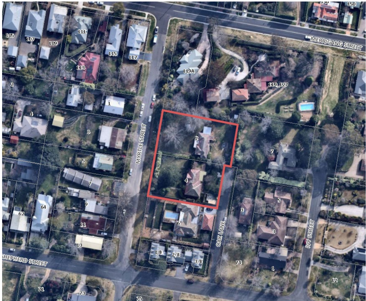
Figure 1: Aerial photo (17 August 2021) showing the housing mix in Myrtle Street and the substantial properties at nos. 2 & 4 (subject to IHO No. 12 and outlined in red) and neighbouring no. 6.

The sites are zoned R3 Medium Density Residential and each site is over 1,600m 2 in area. In 2020, the Low Rise Housing Diversity Code contained within State Environmental Planning Policy (Exempt and Complying Development Codes) 2008 came into force in the Shire which allows for dual occupancies, manor houses and terrace style developments to be undertaken under certain circumstances as complying development.