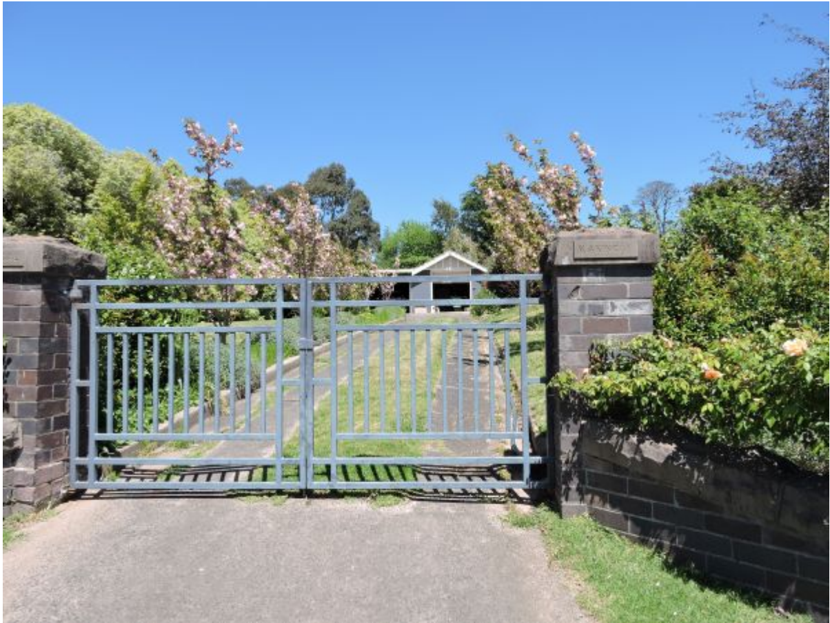
Figure 4: Detail of entry gate with aesthetically significant brick and trachyte fence.

On 21 September 2021 a development application (DA 22/0513) was lodged for a 2-lot subdivision of the site with a carport proposed in front of the building line of the existing house. On 23 September 2021 a further DA (DA 22/0535) was lodged for a multi dwelling housing proposal on the proposed subdivided “vacant” lot. These applications were notified to neighbours and there has been a significant interest in these proposals.